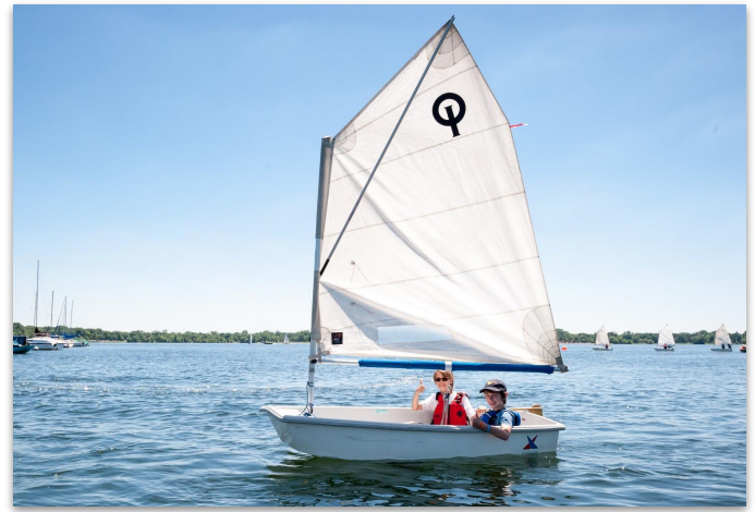
The Opti is our smallest sailboat and a great beginning option for young sailors.