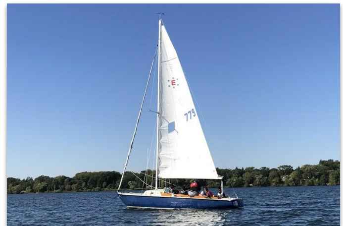
Ensigns are the largest, most stable boats in MSC's fleet and accommodate up to 6 adults.

Community Event participants are encouraged to return for Start Sailing introductory outings and to enroll in Youth, Family, and Adult Classes.