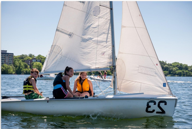
420s are quick, agile boats, popular for youth development and racing.

MSC partners with organizations across the Twin Cities to introduce youth and adults to sailing. Partnerships range from short 1-hour sailboat rides and day-long field trips to group enrollment in classes. Groups can be as few as three people and up to 100 sailors. Events can be customized for your specific group.